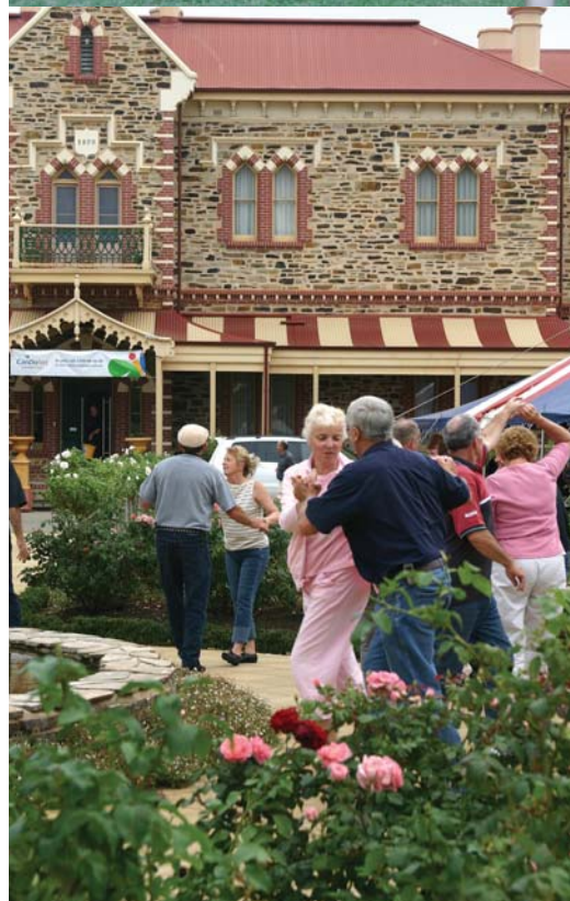
The Boomers inspired twists and turns at every corner, on and off the dance floor at Sunday in the Sun.