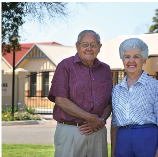
Townsend Park residents enjoy the security, lifestyle, sense of community and ambience of the village and communal grounds.

The first two stages of the village are now well and truly established and residents can often be seen walking through the grounds or enjoying picnics and barbeques with family and friends.