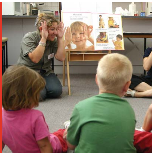
This Auslan Playgroup learnt the importance of facial expressions when communicating in sign language.