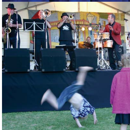
Gumbo Ya! Ya!'s infectious party spirit brought out unexpected moves and grooves from youngsters at MusicFest "Sunset Jazz".