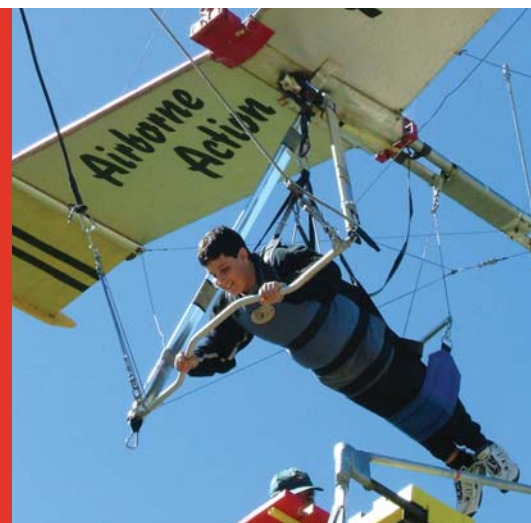
With a little fear and great determination these teenagers cable hang-glied at Old Noarlunga, as part of their monthly Adventure Club program.