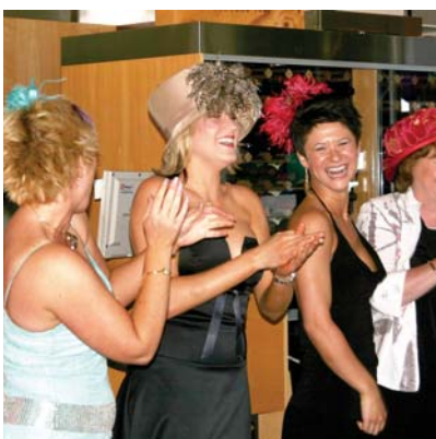
Gourmet food, wine tastings and interactive fashion parades helped to make our 2004 Melbourne Cup lunch at Scampi's on the Beach (Gleneilg) loads of fun!