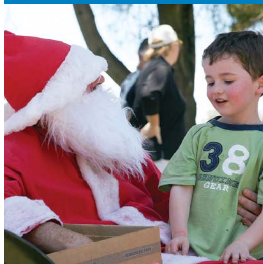
Santa made our Christmas BBQ very special for this little boy.