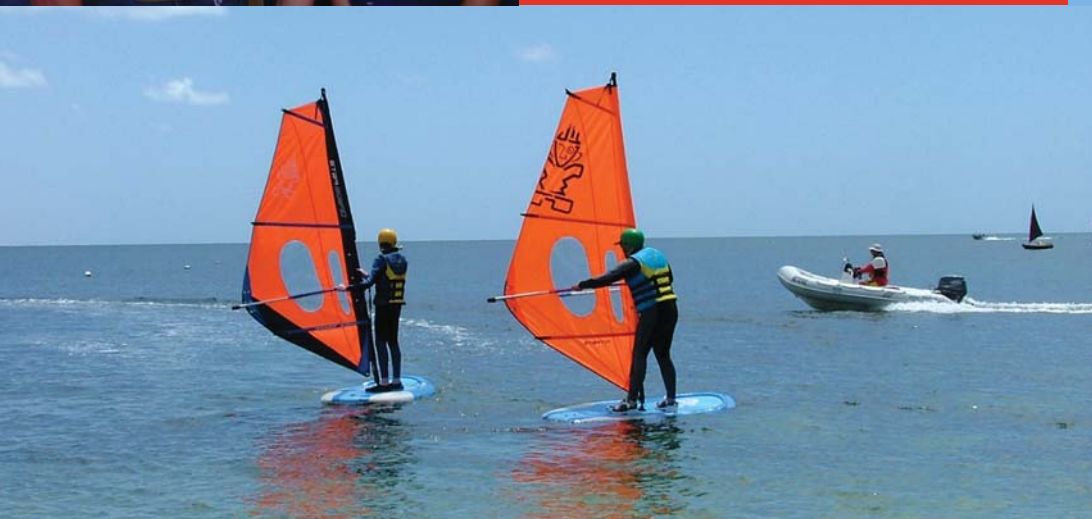
Wind-surfing was just one of many adventures experienced by young adults at the annual Port Vincent Aquatics Camp.