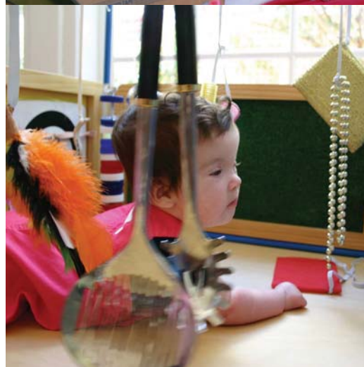
The Little Room encourages babies to become aware of physical objects and boundaries and explore movement.