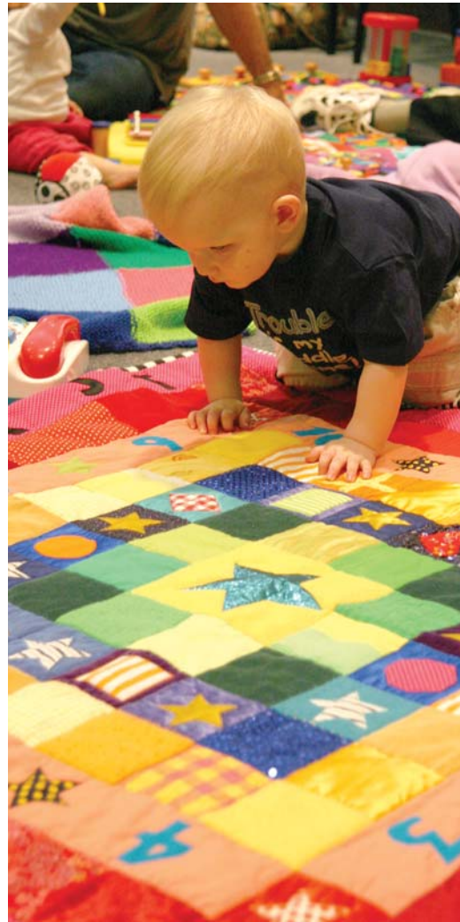
Tactile rugs (made and donated by volunteers) allow babies with little or no vision to explore different tactile sensations in a safe and comforting environment.

The Board of Directors of CanDo4Kids-Townsend House strives to achieve best practice in meeting its responsibilities for the overall corporate governance of the Organisation.