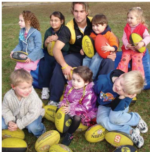
Our "Fun For Under Fives" group was thrilled to play and pose with a Glenelg Footballer. The Deaf and hearing impaired kids meet on a regular basis to enjoy play-based activities with a mix of physical exercise and communication.

Our children's service has a strong family centred practice and a focus on providing a broad range of services and support.