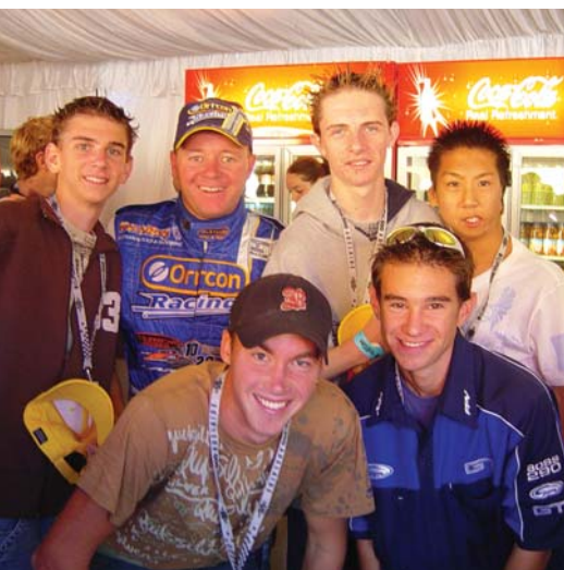
These young adults felt adrenaline rush through their blood at the Clipsal 500 and met racing drivers in the corporate area.

Recreation is all about “being there - enjoying the thrills and the excitement”. This year was no exception and 40 tickets were received from the Department of the Premier & Cabinet’s Clipsal 500 so that kids and their parents had a first class seat to this event. The excitement just got better when BankSA provided a private box at the Adelaide Entertainment Centre for kids to enjoy the Motor Cross Event.