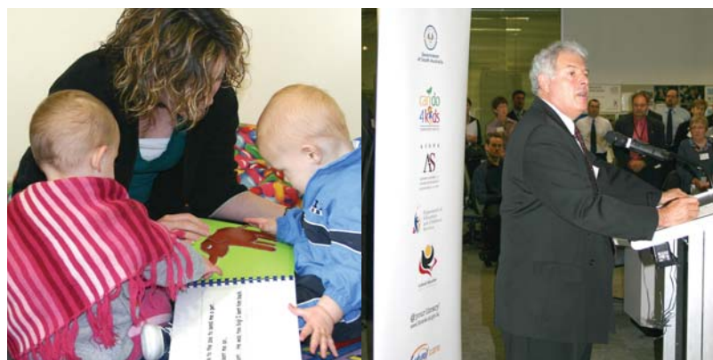
Adults help babies to enjoy reading tactile books (with "touchy feely" pictures, words and Braille) from a very early age.

All programs are providing increased services and these are linked through the case management system. Family Support is the keystone of this service and this year we have been busy developing new parent networks, two of which are in the country – Whyalla and Mt Gambier.