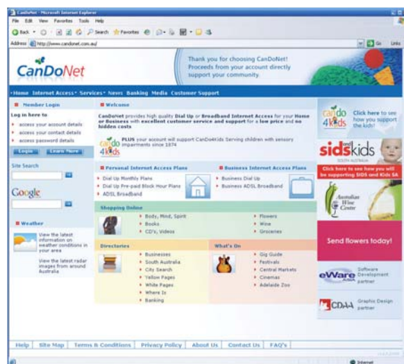
The CanDoNet homepage is clean, user-friendly and functional in design, with links and search engines that allow access to useful information at the click of a mouse.

CanDoNet is an exciting initiative, which offers premium Dial-Up and Broadband Internet access, Web Hosting, Web Design, Networking and Support Consultancy at competitive prices. It is Australia's first Internet Service Provider owned and developed by a community organisation for the benefit of the community. All profits raised go directly to young individuals who have sensory disabilities via the CanDo4Kids Foundation, providing them with services that will assist them to participate in learning and social activities and to enjoy quality of life. We have recently been recipients of innovation awards for this entrepreneurial venture.