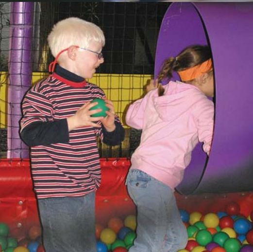
Kids with albinism and their siblings "had a ball" at Jumping Beans Playhouse Café. The outing formed part of our Family Support program, which caters for the entire family unit.