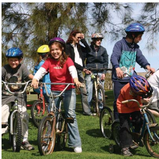
Our older kids explored the grounds of Townsend House on bikes during their school holidays.

In line with our vision to "be an organisation that excels and is recognised for a range of support and services to children and young adults who have a sensory impairment," a number of special projects and new initiatives have been introduced.