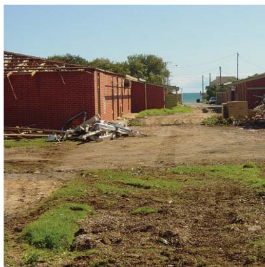
The old school buildings are reduced to rubble and amazing sea views have appeared for the future site of Townsend Park - Stage Three.

All of our major commercial initiatives have proven to be extremely successful to date. Townsend Park Retirement Living has two of the three stages complete and 49 Villas are now occupied. The residents of Townsend Park are a great group of people who add much to the fabric of our mini community at Hove. The third stage of the development has commenced and will see 12 'Mews' style cottages completed in late 2006, followed by 47 executive apartments due for completion in early 2007.