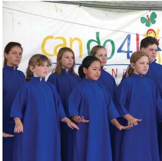
A performance by the Klemzig Primary School Signing Choir (Deaf and hearing students signing to music) was a highlight at this year's Invitation Day.