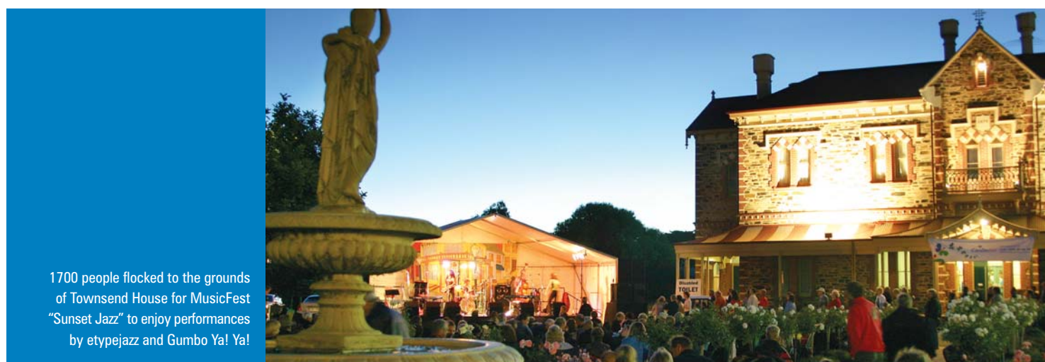
1700 people flocked to the grounds of Townsend House for MusicFest "Sunset Jazz" to enjoy performances by etypejazz and Gumbo Ya! Ya!

On behalf of the Board I wish to extend my thanks to all members of staff for their contribution to enhancing the lives and learning opportunities of children who have a sensory impairment, and to supporting the families of these children.