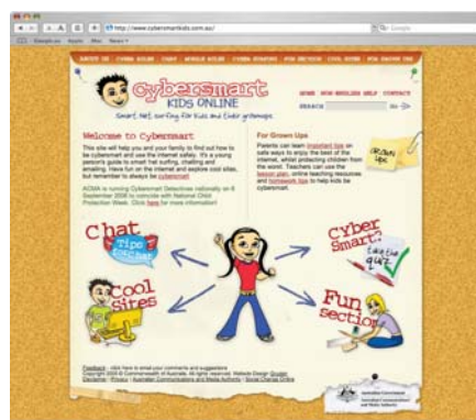
Cybersmart promotes online safety for young people. CanDo4Kids provides information and training for young people and their parents about safe internet use.

Cybersmart Detectives has been advertised widely, it is a national program involving a number of schools and children from CanDo4Kids - Townsend House.