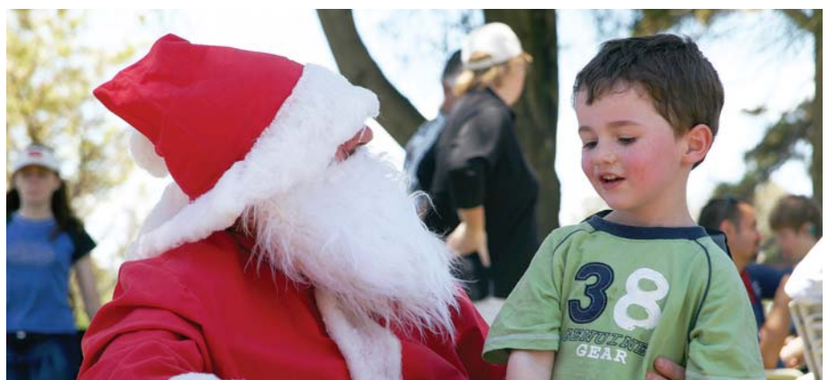
Santa made our Christmas BBQ very special for this little boy.

The conference gave a much wider insight into the area of hearing impairment and the chance to meet with parents, parent groups and organisations. This ensures we remain at the leading edge in services to children who are deaf or hearing impaired.