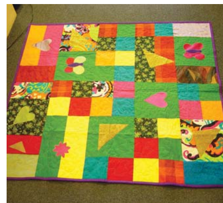
Volunteers help create valuable tools used in our children's programs.