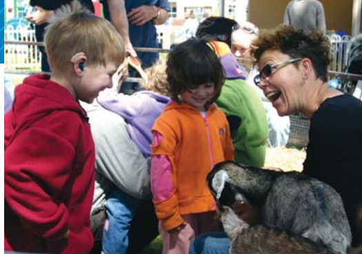
Children enjoyed being able to see, touch, feel and smell baby farm animals from Old McDonald's Farm.