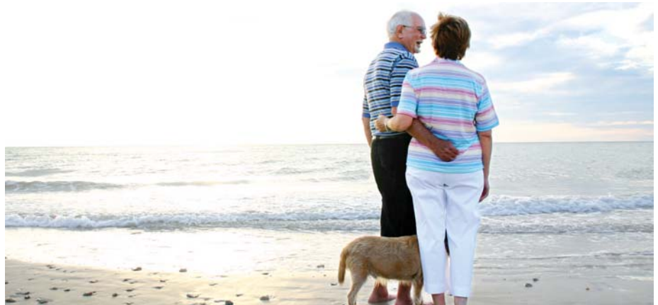
Townsend Park residents enjoy the retirement lifestyle the beautiful surroundings offer.

As a result of our expansion into the Retirement Lifestyle area, we have decided to formalise this process by registering SARRM to focus on opportunities for income development coming from this niche area. At this point Townsend House, via SARRM has signed a management and consulting contract with WaterGarden Retirement Estate in Fulham Gardens and enter into a tri-partite joint venture to develop Strathalbyn Grove in Strathalbyn.