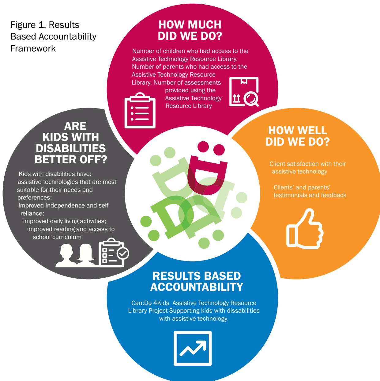
Figure 1. Results Based Accountability Framework